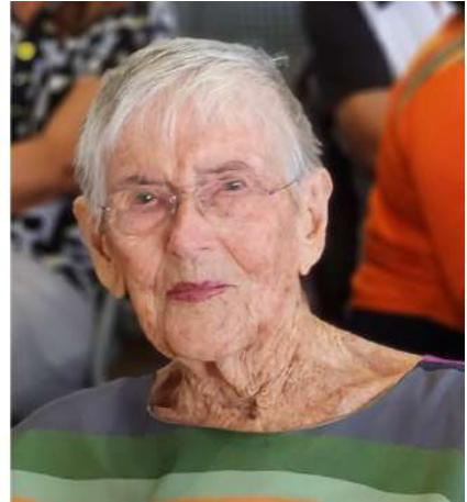
50th Celebration 2023